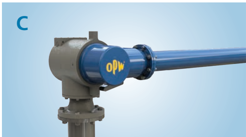
COMPACT TORSION SPRING